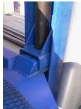
Safety against cable failure.