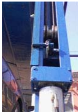
Mechanical security system.